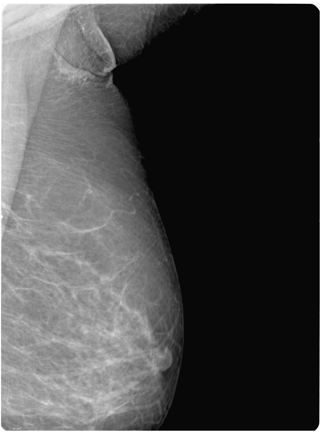
Left MLO view