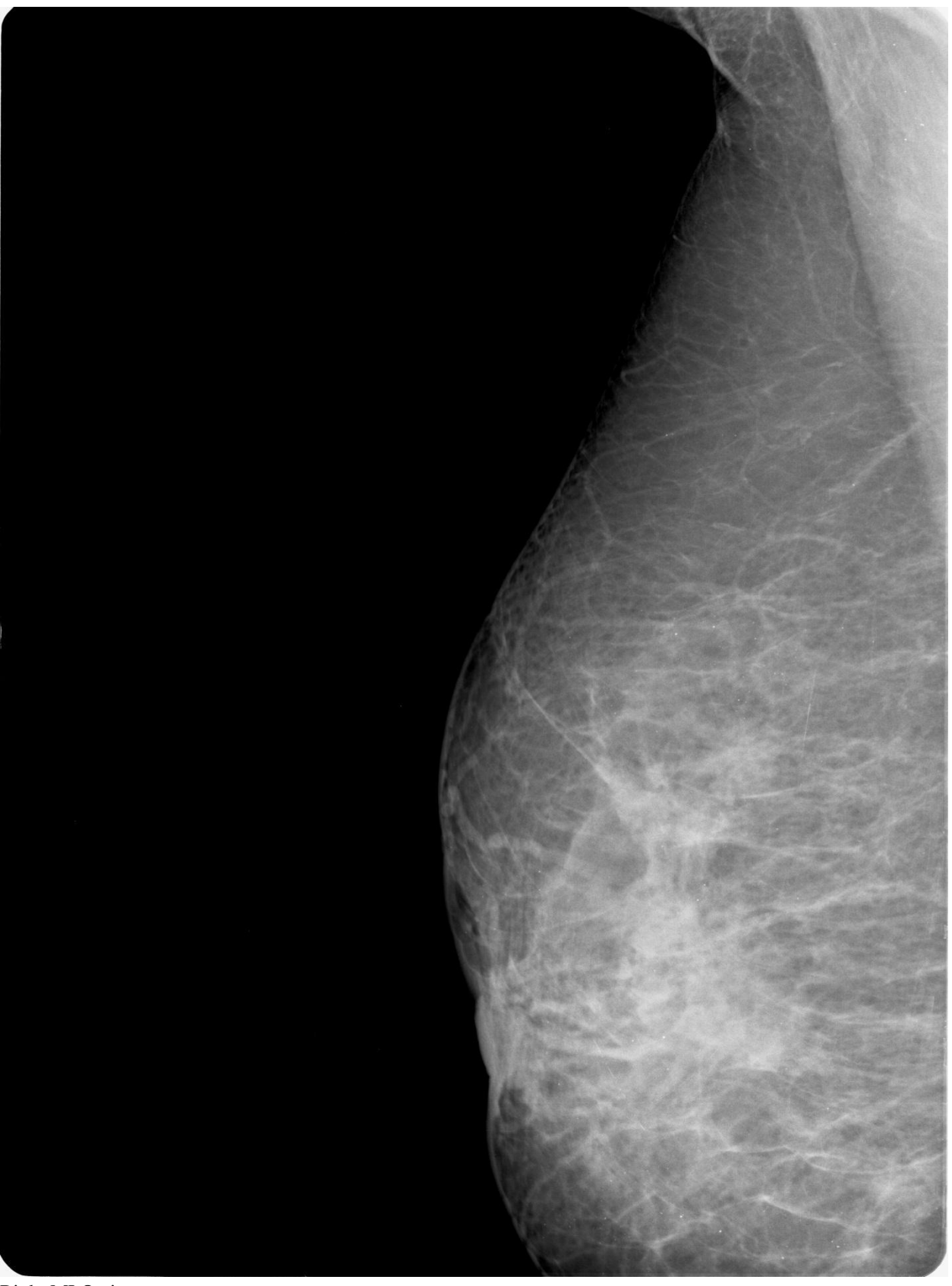
Right MLO view